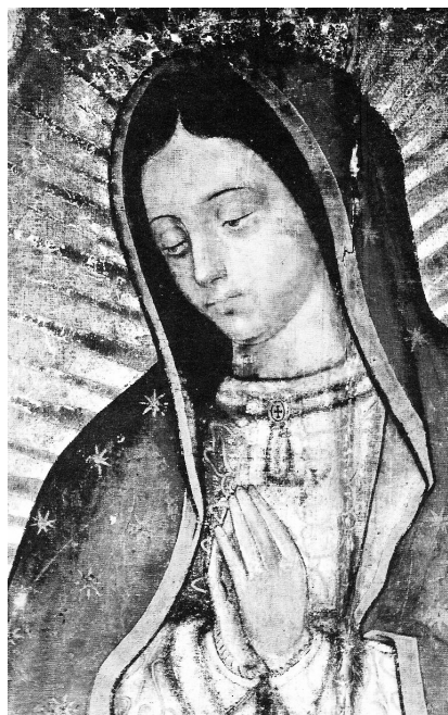
OUR LADY OF GUADALUPE PATRON OF THE AMERICAS