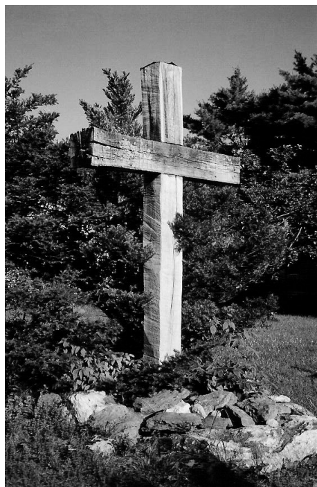
MONASTERY CEMETERY CROSS